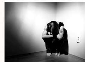
Most patients will have failed multiple treatments prior to using ketamine.

Ketamine is for patients with treatment-resistant depression (including depression in bipolar disorder) and PTSD. Ketamine is not for cases of depression or PTSD that respond to standard treatment. Most patients referred for ketamine will have tried psychological counseling, antidepressants, mood stabilizers, and many other medications without success.