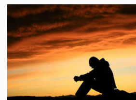
Many people can break out of their negative behaviors.