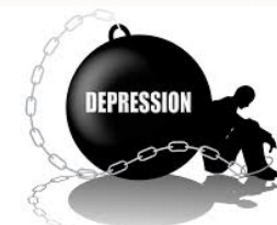
Ketamine may mean freedom.